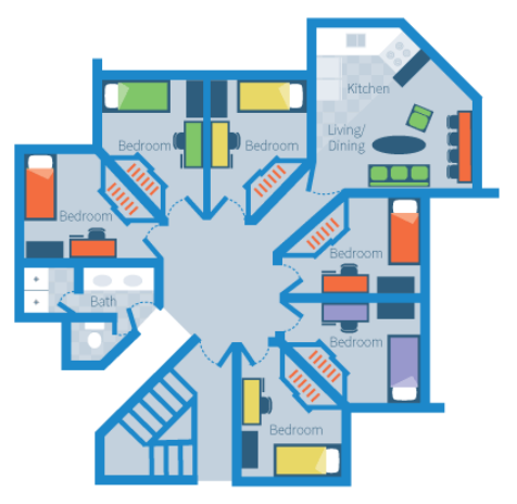
Sample layout of a six bedroom shared apartment

If capacity in the apartments and semi-private units is exceeded, students will be placed in traditional student dormitories. Traditional student dormitories do not have cooking facilities; instead, dinner will be provided Monday to Thursday.